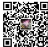
WeChat account 2